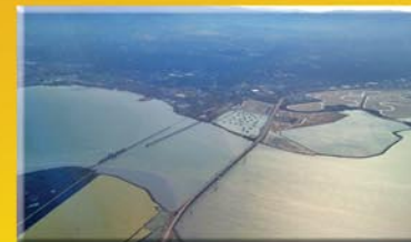
(Right) The Dumbarton Bridge and south San Francisco Bay salt ponds, on final approach to SFO. San Francisco skyline and traffic on US 101. A cold fog rolls into downtown San Francisco toward evening.