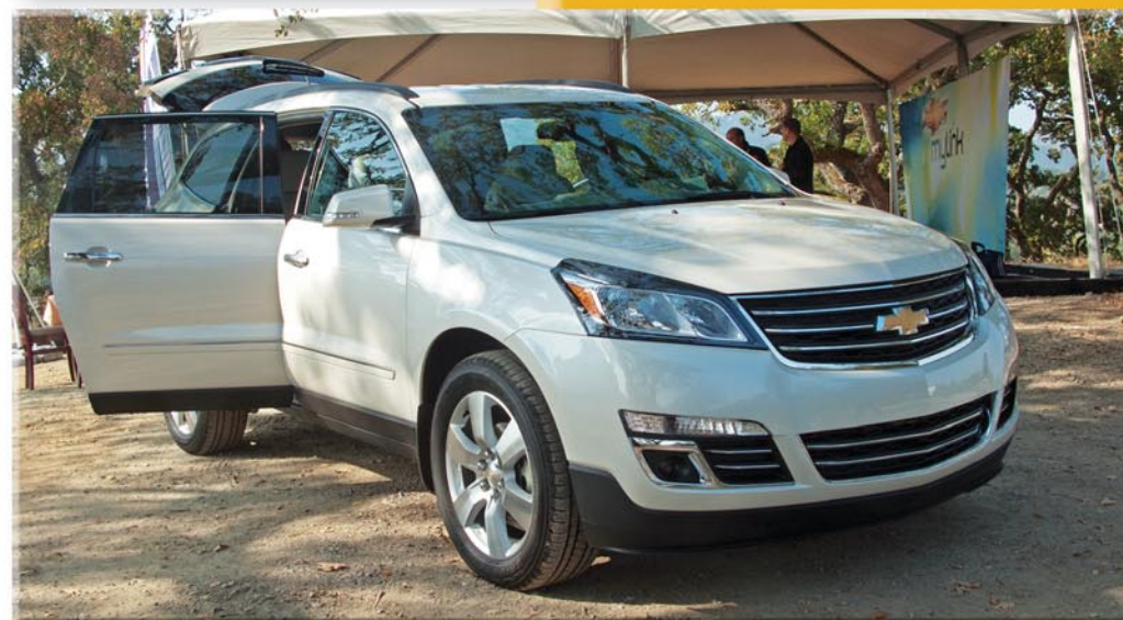
(Above) The 259-hp 2013 Chevrolet Malibu Turbo and the eight-passenger 2013 Chevrolet Traverse.