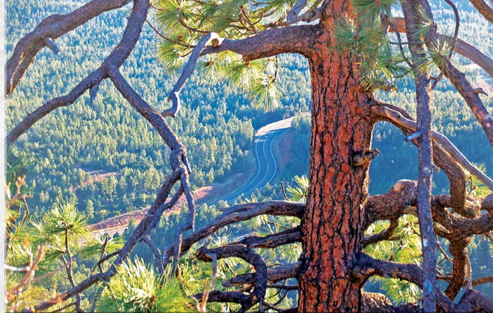
Forest Road 300 runs along the edge of the Mogollon Rim above Payson. From the unpaved road's eastern end, you can look down on those traveling at a much faster pace on the pavement of state highway 260.

D o the math: 38.1 miles in 3 hours. But that's like 12-point-something miles per hour! A good marathon runner could cover that distance on foot. So could most people who ride bicycles. And yet the route book says we should plan on three hours to cover a mere 38.1 miles of what it rates as the easiest of all unpaved surfaces?