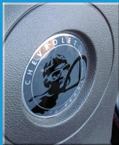
Clockwise from above: A sign on the road assures you're on the right road. Racer Louis Chevrolet gained fame on the race track, and the car that bears his image would please his racy nature. Speaking of nature: Oatman is known for its wandering burros. Sometimes called the jack ass, an Oatman emporium proclaims that even an ass can have class.