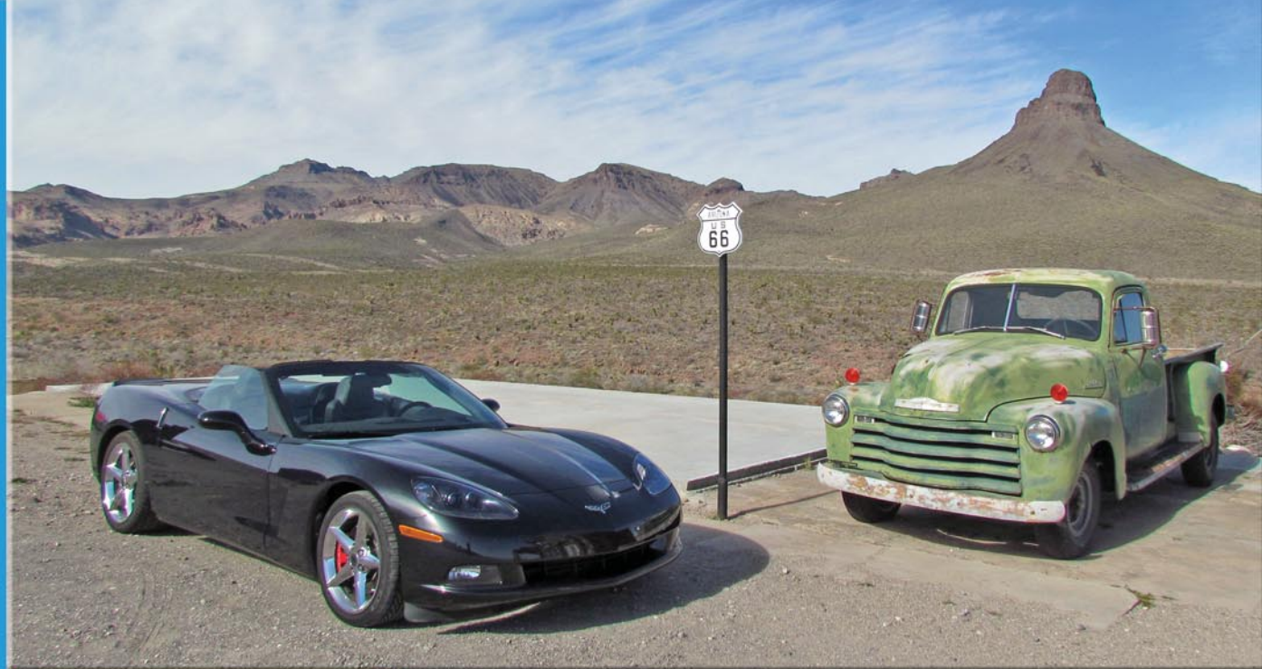
The new Corvette and a vintage Chevrolet pickup at the Cool Springs Station west of Kingman (above). Left, one set of Burma Shave signs. Opposite page: Mountain curves, and an historic gas station in Peach Springs.