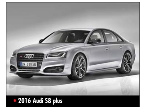
• 2016 Audi S8 plus