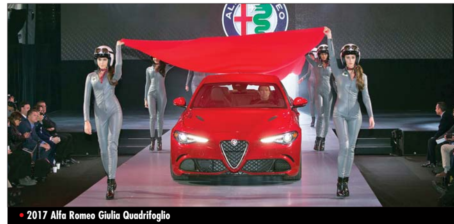
• 2017 Alfa Romeo Giulia Quadrifoglio