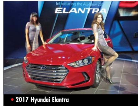
• 2017 Hyundai Elantra