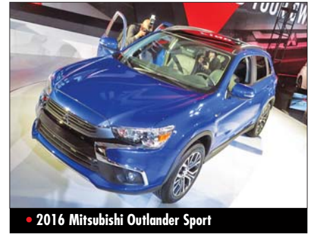
• 2016 Mitsubishi Outlander Sport