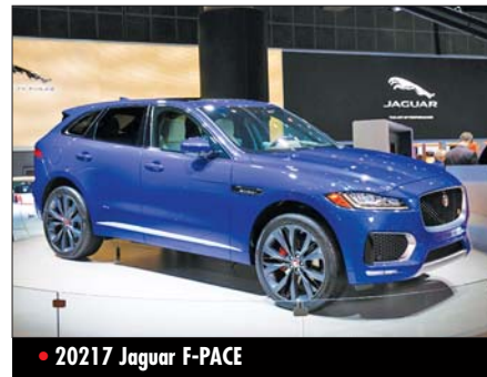
• 2017 Jaguar F-PACE