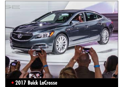
• 2017 Buick LaCrosse