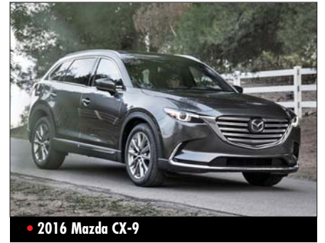
• 2016 Mazda CX-9

The LA show has evolved to have fewer manufacturer product reveals and a concurrent Connected Car Expo. The manufacturers always have more on tap for the next round of shows. Up next, domestic: Detroit, Chicago and New York. ■