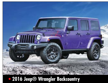
• 2016 Jeep® Wrangler Backcountry