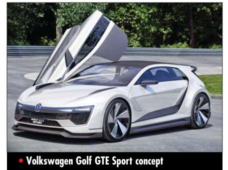
• Volkswagen Golf GTE Sport concept