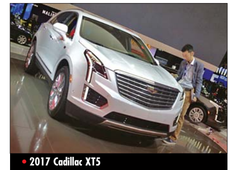
• 2017 Cadillac XT5