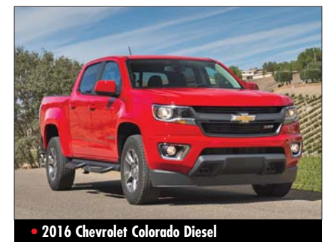
• 2016 Chevrolet Colorado Diesel