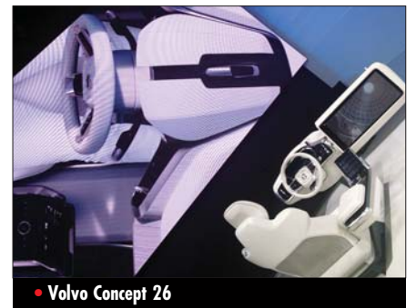
• Volvo Concept 26