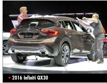
• 2016 Infiniti QX30