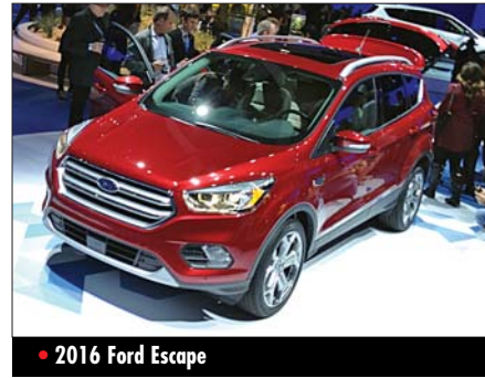
• 2016 Ford Escape

• Kia Sportage has checked all the right boxes for many years, a pioneer in its compact crossover segment (and their longest-running nameplate). The fourth-gen Sportage receives a complete rework, starting with its skin. Headlights move up and out, which looked startling in early photos but works well in person. (Its test mules had raised so much interest on highways and byways for months, the new