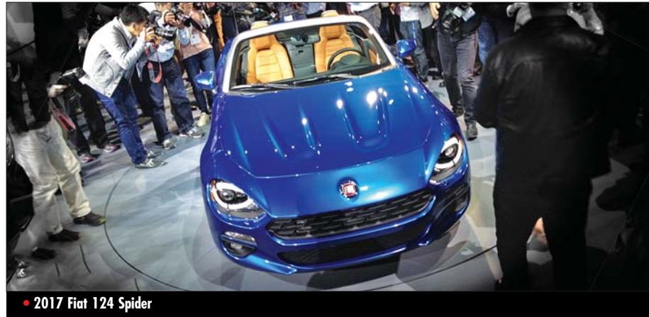
• 2017 Fiat 124 Spider

body, 5.5 inches longer (with a larger trunk), a hair wider and almost 100 pounds heavier. Its 1.4L turbo is from the 500 Abarth, giving it a bit more horsepower and a lot more torque than the Miata. The Fiat 124 Spider arrives this summer.