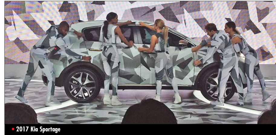
• 2017 Kia Sportage

Sportage was revealed through a camo-strip.) Structure is stronger and lighter—more spacious inside, more fuel economical than ever, with improved handling and NVH control. A full array of driving assist technologies and driver interface upgrades round out the package. The new Sportage arrives later this year as a 2017 model. Kia also had a full array of stunning and intriguing concepts and modified vehicles on hand.