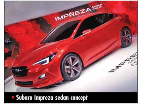
• Subaru Impreza sedan concept