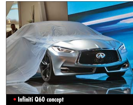
• Infiniti Q60 concept