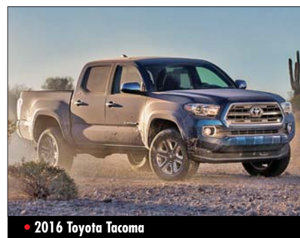
• 2016 Toyota Tacoma