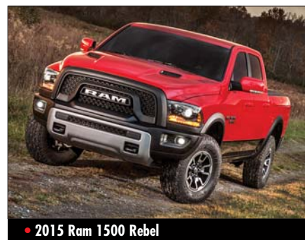
• 2015 Ram 1500 Rebel