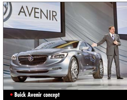
• Buick Avenir concept