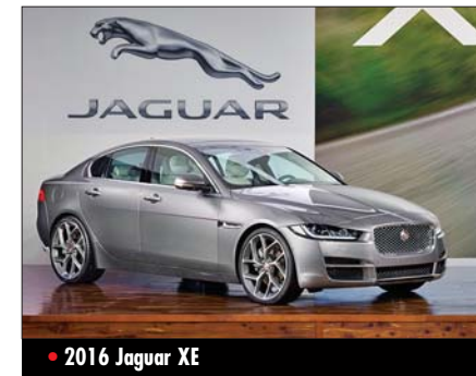
• 2016 Jaguar XE