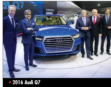
• 2016 Audi Q7