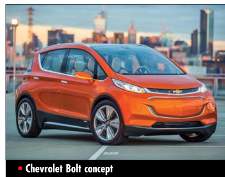
• Chevrolet Bolt concept