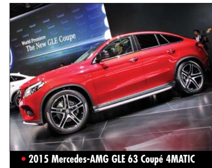
• 2015 Mercedes-AMG GLE 63 Coupé 4MATIC