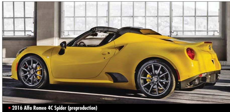
• 2016 Alfa Romeo 4C Spider (preproduction)