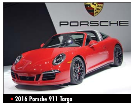
• 2016 Porsche 911 Targa

The 2016 Volvo S60 Inscription is an upsized S60 sedan, with larger interior dimensions for US customers—a full 3.4 inches of additional rear seat legroom, thus rating best-in-class. Materials are intended to reflect the car's Scandinavian origins, including walnut trim and "silk metal." But the biggest news may be that the S60 Inscription will be now-Chinese-owned Volvo's first Chinese-built Volvo sold in the US, and thus the first Chinese-built car of any sort for sale in the US. ■