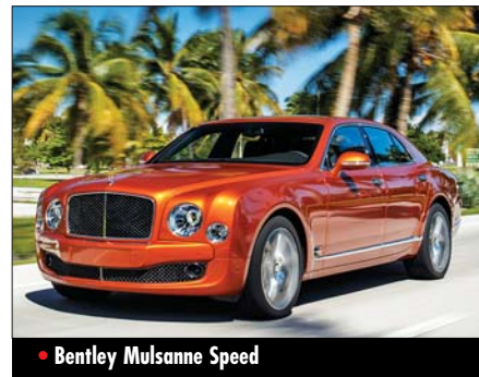
• Bentley Mulsanne Speed