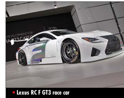
• Lexus RC F GT3 race car