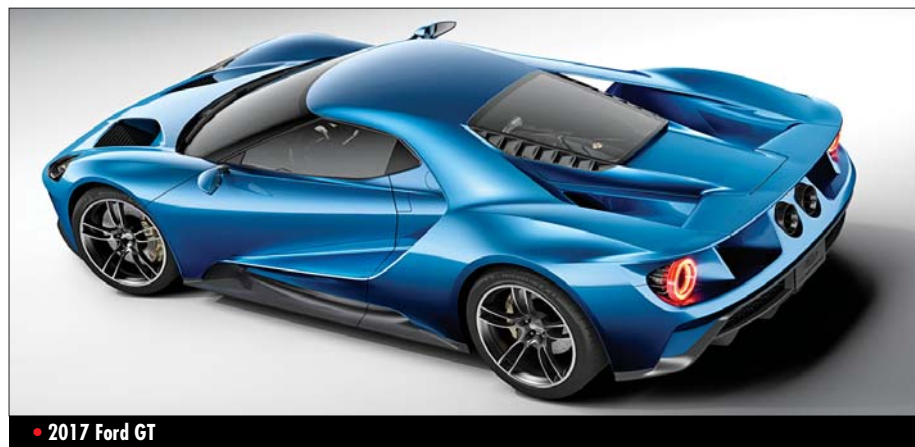
• 2017 Ford GT

show. At 2,755.8 pounds, it carries a modified V8 with 540-plus hp. Lexus will supply GT3-compliant vehicles to racing teams starting this year. GT3 cars qualify for events such as the 24 Hours of Nürburgring in Germany and the Super Taikyu Endurance and Super GT series in Japan.