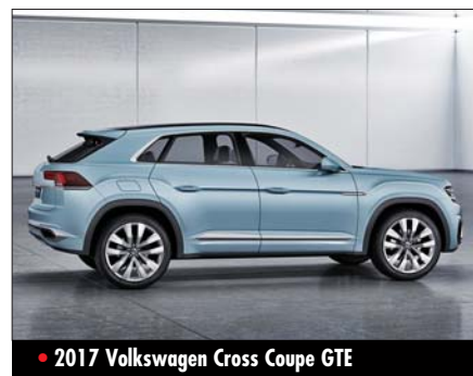
• 2017 Volkswagen Cross Coupe GTE