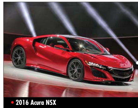
• 2016 Acura NSX