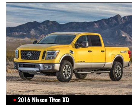
• 2016 Nissan Titan XD