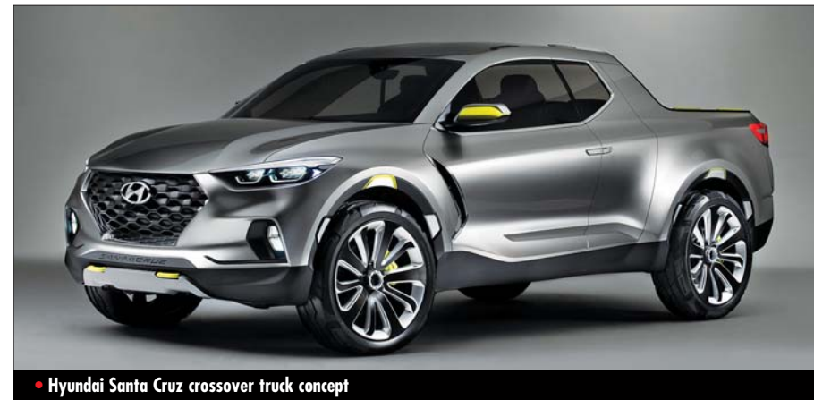
• Hyundai Santa Cruz crossover truck concept

increase in fuel efficiency. The vehicle is smaller outside and larger inside. Infotainment and driver assistance technologies are upgraded.