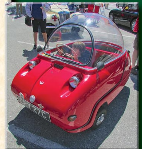
(Below): Cars of all sizes attract enthusiasts of all sizes. This British Trident 3-wheeler sets the tone for The Little Car Show, a free event in downtown Pacific Grove.