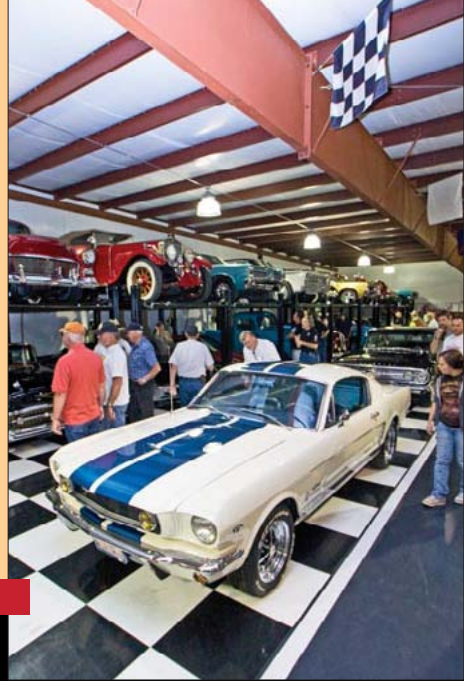
STOP #1: AJ'S GARAGE, CAVE CREEK

Starting things off was the Goodguys Hot Rod Tour and Kick-Off Party, hosted by The Over the Hill Gang, with stops at points of genuine motorhead interest across the Valley from Cave Creek to Chandler and all points in between. Rods, customs, muscle cars and classics showed up at 9.30am on Thursday, November 18 with a full tank of gas at WestWorld to launch