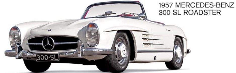
1957 MERCEDES-BENZ 300 SL ROADSTER