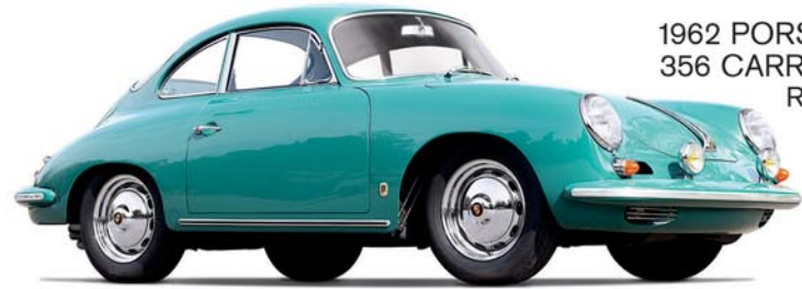
1962 PORSCHE 356 CARRERA 2 COUPE Rare Factory Sunroof Matching Numbers