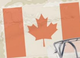
1967 SHELBY 427 S/C Sold in Arizona 2007 for $1,430,000 to a buyer in Canada