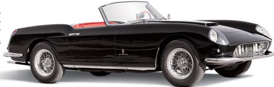
1959 FERRARI 250 GT SERIES 1 CABRIOLET CHASSIS 1181GT Coachwork by Pinin Farina